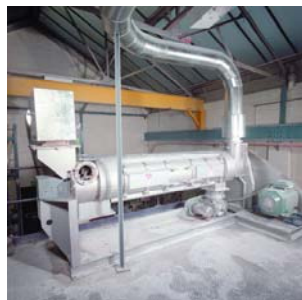
Atritor-Scott AST Dryer for Chemical, Minerals and Environmental Waste.