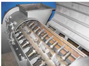
Atritor-Scott Turbo Separator Separates Product from Packaging for Recycling or Disposal.