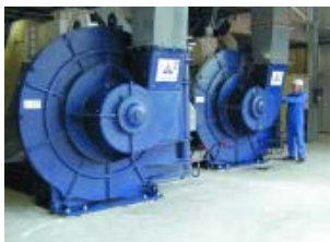
"A" & "B" Series Atritor Dryer-Pulverisers for Chemicals & Minerals.